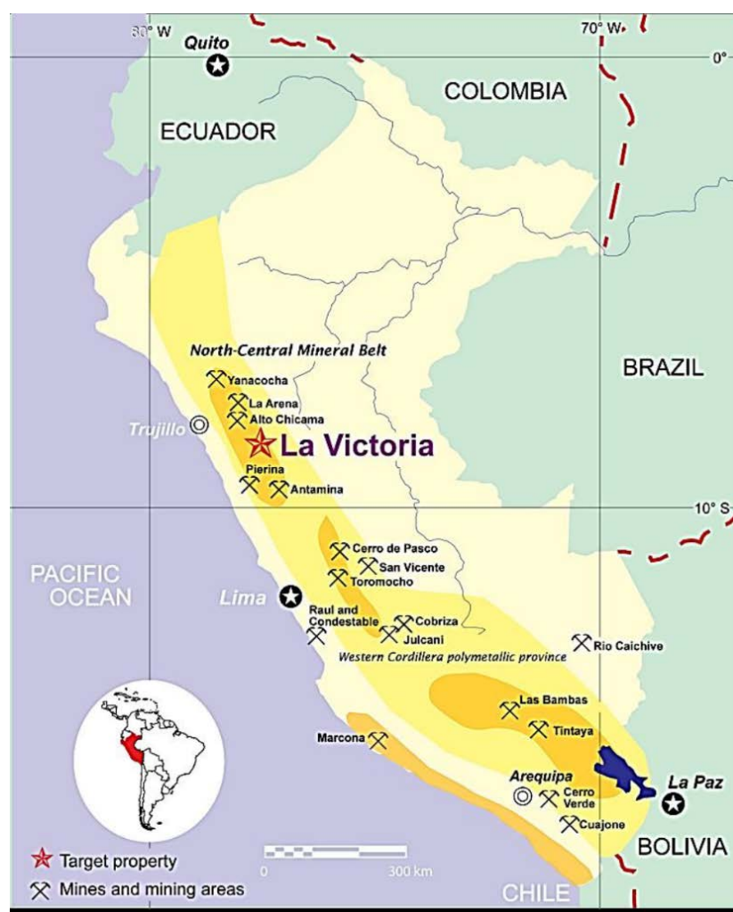
Figure 1 – La Victoria Location

Eloro is a Canadian exploration and mine development company which holds a 100% interest in La Victoria. The Property is located in Huandoval District, Pallasca Province, Ancash Department, in the prolific North-Central Mineral Belt of Peru and covers approximately 80.4 square kilometres. It is situated near world-class, low cost gold producers, and holds excellent potential for discovery. La Victoria has never been drilled previously, and five principal mineralised zones have been identified which will be the subject of an intensive drilling program over the next 18 months.